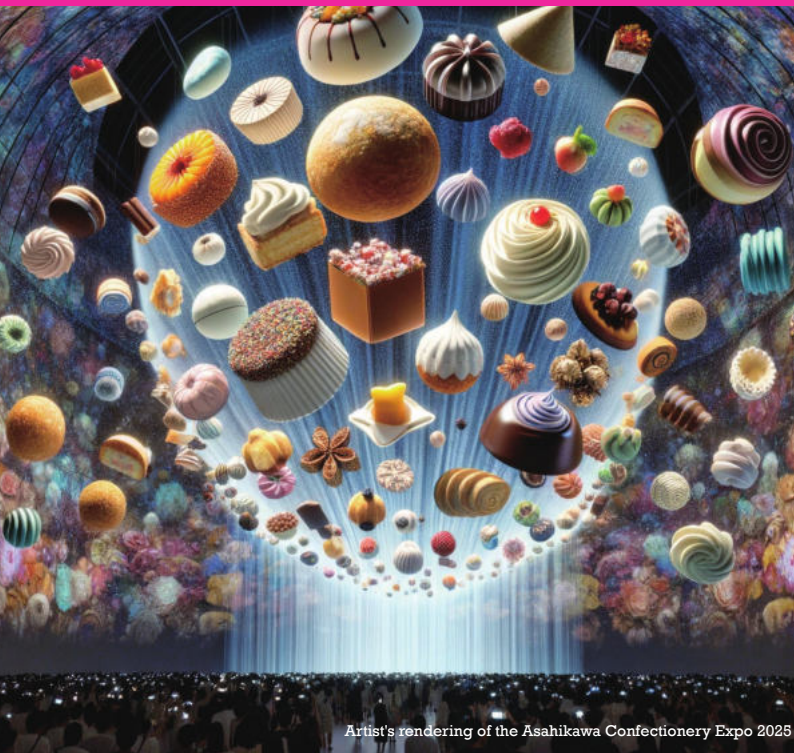
Artist's rendering of the Asahikawa Confectionery Expo 2025