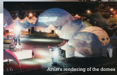
Artist's rendering of the domes

Two white rock domes, one large and one small, will be set up inside the Taisetsu Arena. In the smaller dome, visitors will be greeted by a beautiful arrangement of 'origami cranes', folded by hand using wrapping paper from participating Confectionery Expo stores and imbued with prayers for peace. As visitors enter the main dome, they will be surrounded by a variety of Japanese and Western confectionery displayed on the interior walls of the dome, as well as an impressive and beautiful projection mapping of Hokkaido's vast farms, fields, and agricultural produce.