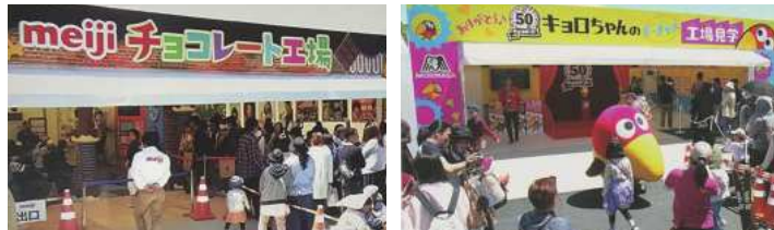
Photos from the 2017 "Oise-san Expo" in Mie

Exhibits by major confectionery manufacturers. Fun for the whole family!