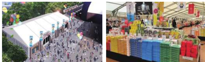
Artist's rendering of the Asahikawa Confectionery Expo 2025

Sweets that can normally only be purchased in specific regions of the country will be on sale.